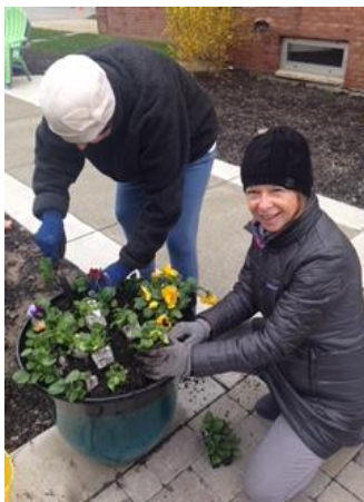
Planting pansy pots in the Pocket Park

Follow us on www.Facebook.com/williamsville