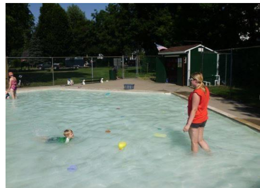
Garrison Park Wading Pool